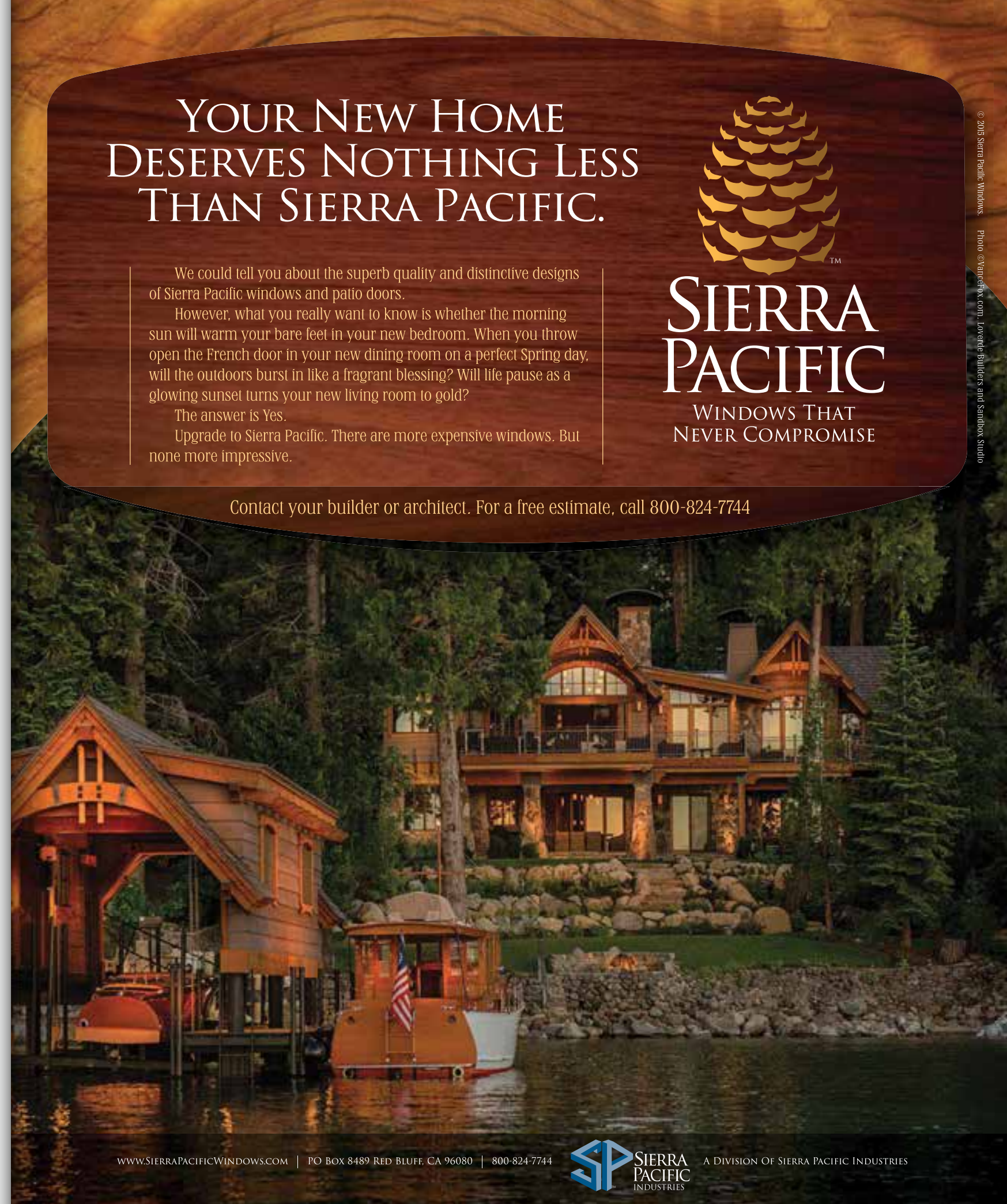
© 2015 Sierra Pacific Windows. Loveland Builders and Sandbox Studio

Contact your builder or architect. For a free estimate, call 800-824-7744