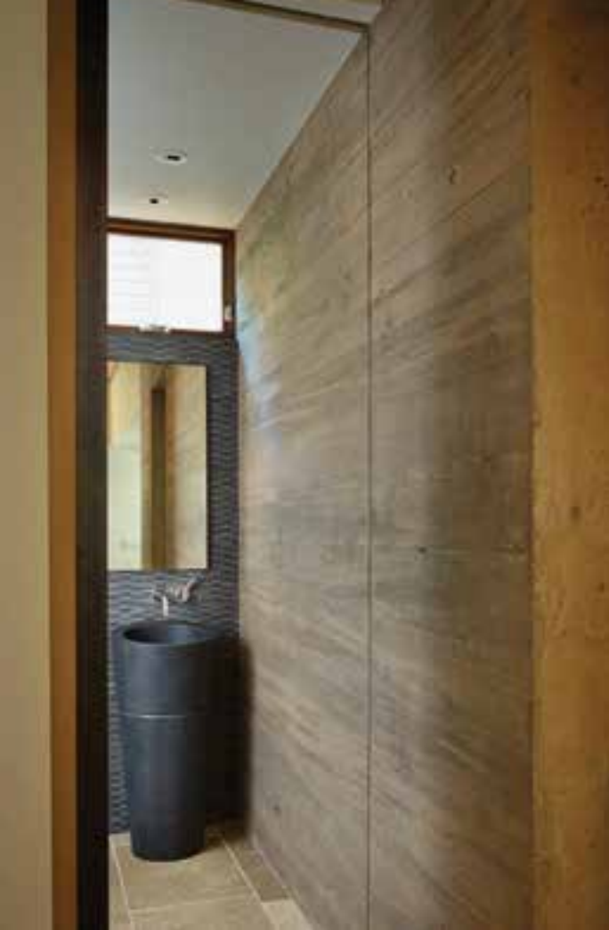
TOP LEFT A concrete powder room wall plays off Stone Forest Veneto Sink and Mud Wood Chip Mosaic tile. BOTTOM LEFT Vertical channel glass shower. BELOW Master bedroom with built-in fireplace, private deck overlooking lake. RIGHT Burfiend and DeForest designed custom rift cut white oak cabinets and a plain sawn walnut island by Woodway Woodworks.