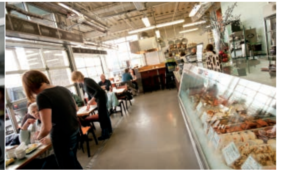
LEFT Laura Anderson of Local Ocean showcases the daily catch. Purists will want to order the two pound whole cooked crab in the shell. On blustery days, warm up with the soul-satisfying Roasted Garlic and Dungeness Crab Soup. ABOVE A favorite for locals and visitors alike, Local Ocean is the spot to eat on the Oregon Coast. On sunny days, floor-to-ceiling windows with roll-up glass doors spotlight the nearby fishing boats in the harbor and Yaquina Bay. BELOW For many fishermen, time at sea is a gift. OPPOSITE At Local Ocean, the daily catch is labeled with the vessel, the name of the fisherman and how it was harvested.