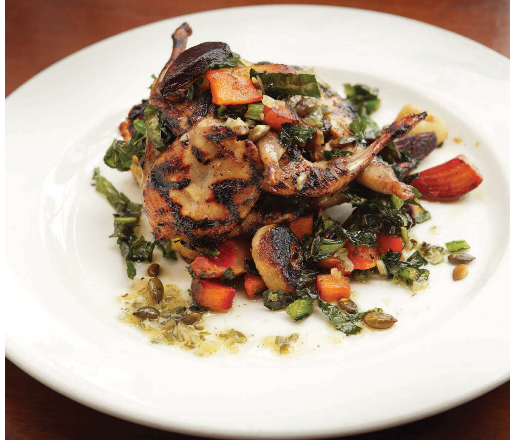
CHIPOTLE & MAPLE GLAZED QUAILS RECIPE ON FACING PAGE

Big Table Farm 2013 Pinot Noir Pelos Sandberg Vineyard Willamette Valley