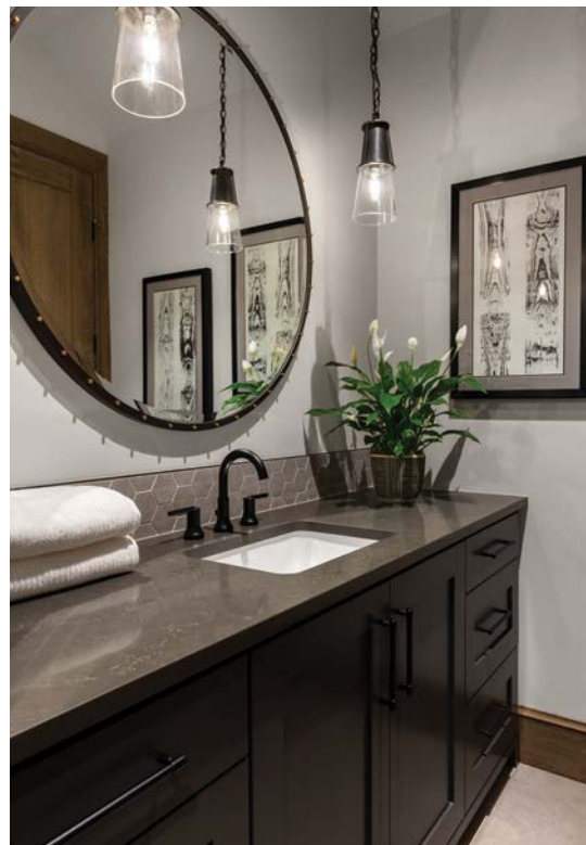
TOP Del Boca Vista conceived hidden speakeasy with Alder and Tweed bar cart, Classic Concepts table from Tiffany Home Design warmed by Regina Andrew chandelier from Globe Lighting. Mystique rug. BOTTOM LEFT Adjacent Bonus Room with cozy Four Hands sectional and coffee table. Phenix Opulent Regal carpet. BOTTOM RIGHT Upper Bonus Room bath Ceasarstone Peitra Gray countertop, Bedrosians Materika hex backsplash. Globe Lighting pendants face Tiffany Home Design mirror. Drift of Mist wallcolor.