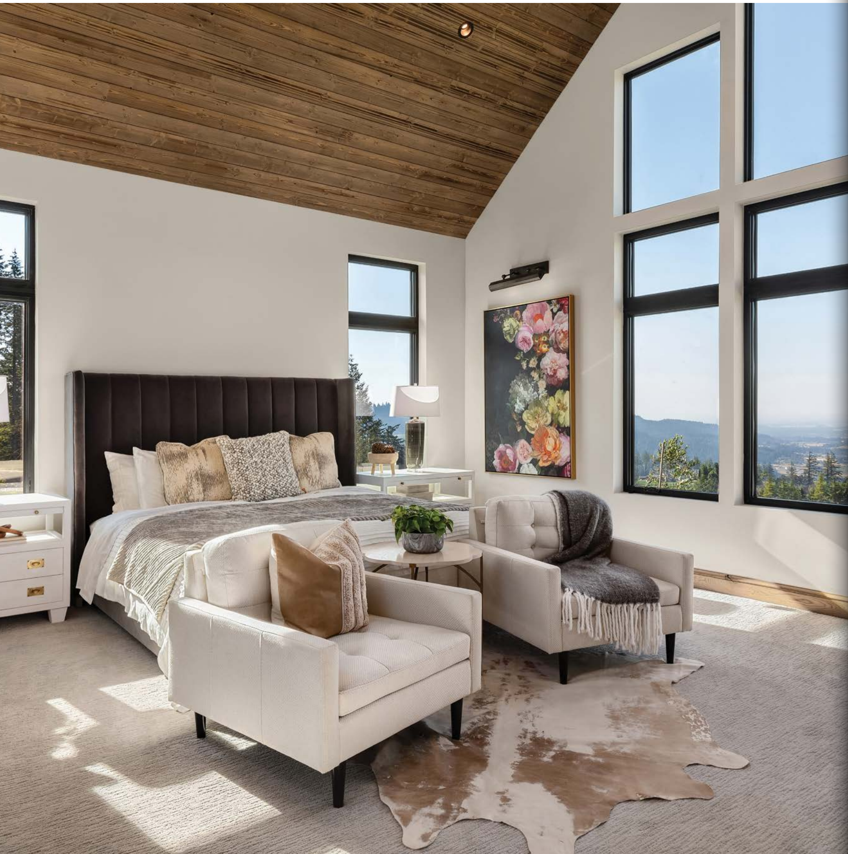
ABOVE The East Wing full ensuite guest bedroom's "story" features gathered elements from worldly travels, including the Old-World style painting from ArtworxLA, echoing the Essentials for Living dark truffle gray channeled headboard. New Pacific Direct chairs provide comfort for TV viewing. OPPOSITE Powder bath's oversized Tropez Foliage Blanco tile inspired many showgoers. Capital Lighting sconce from Globe Lighting teams with brass-trimmed Uttermost mirror and Brizo plumbing. Fresh Concrete Caesarstone countertop crowns cabinet in Succulent Sherwin Williams.