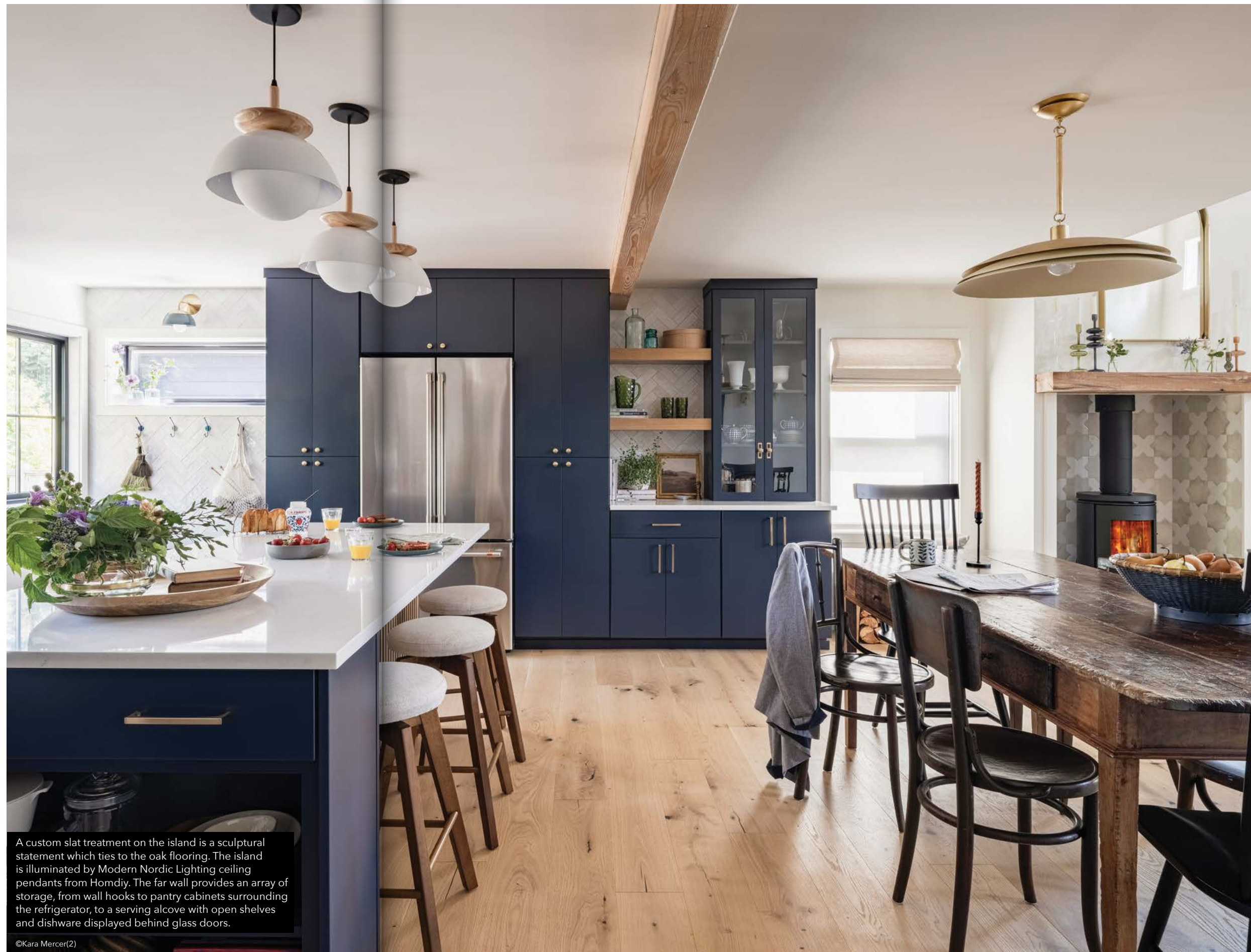
A custom slat treatment on the island is a sculptural statement which ties to the oak flooring. The island is illuminated by Modern Nordic Lighting ceiling pendants from Homdy. The far wall provides an array of storage, from wall hooks to pantry cabinets surrounding the refrigerator, to a serving alcove with open shelves and dishware displayed behind glass doors.