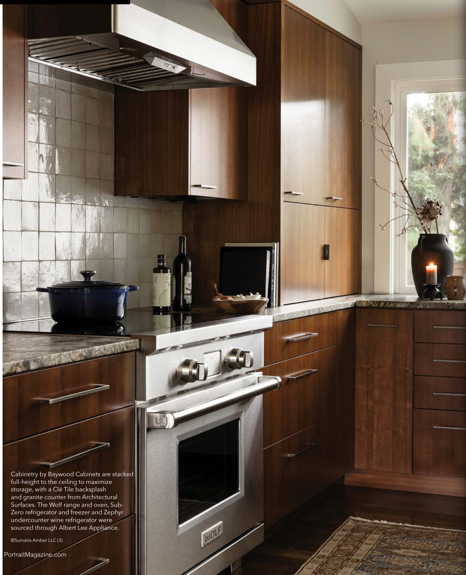
Cabinetry by Baywood Cabinets are stacked full-height to the ceiling to maximize storage, with a Clé Tile backsplash and granite counter from Architectural Surfaces. The Wolf range and oven, Sub-Zero refrigerator and freezer and Zephyr undercounter wine refrigerator were sourced through Albert Lee Appliance.